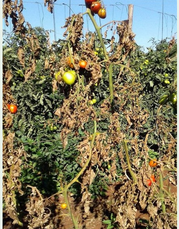
Image left: Damage to tomato plants by Tuta absoluta in South Africa.

18 Chinese and foreign experts made oral presentations which focused on four themes, such as the foundation of tomato leaf moth, biological control, chemical biology and genomics and agricultural control, comprehensive control. The experts also communicated with each other through online oral questions or chat room messages. This successful symposium not only shared experience, promoted exchanges, but also laid a good foundation for further international cooperation and exchanges in the future.